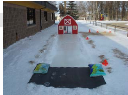
Mitchell Elementary School